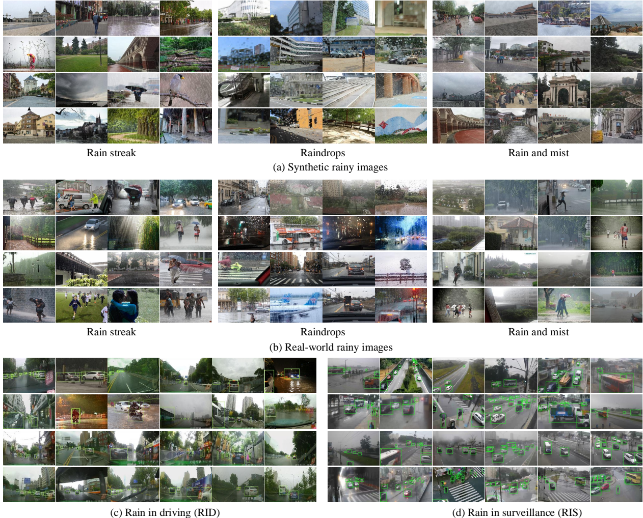
Figure 1. Example images from the MPID dataset. The proposed dataset contains both synthetic and real-world rainy images of rain streak, raindrops, and rain & mist. In addition, we also annotate two sets of real-world images with object bounding boxes from autonomous driving and video surveillance scenarios.

a composition of the rain streak model and the atmospheric scattering haze model [13]: