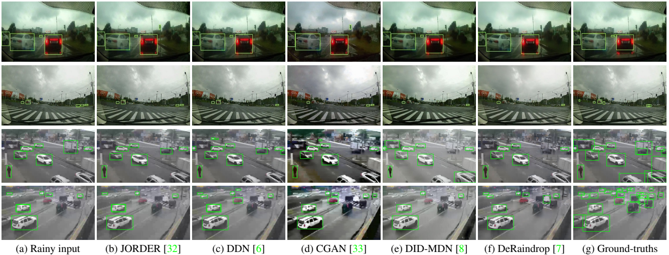
Figure 3. Visualization of object detection results after applying different deraining algorithms on two images (first two rows) from the RID dataset and two examples (last two rows) from the RIS dataset.